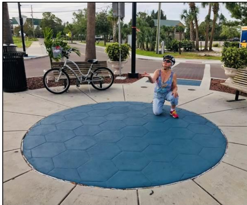
Existing roundabout site at the intersection of Dodecanese and Roosevelt Boulevards, Tarpon Springs, Florida