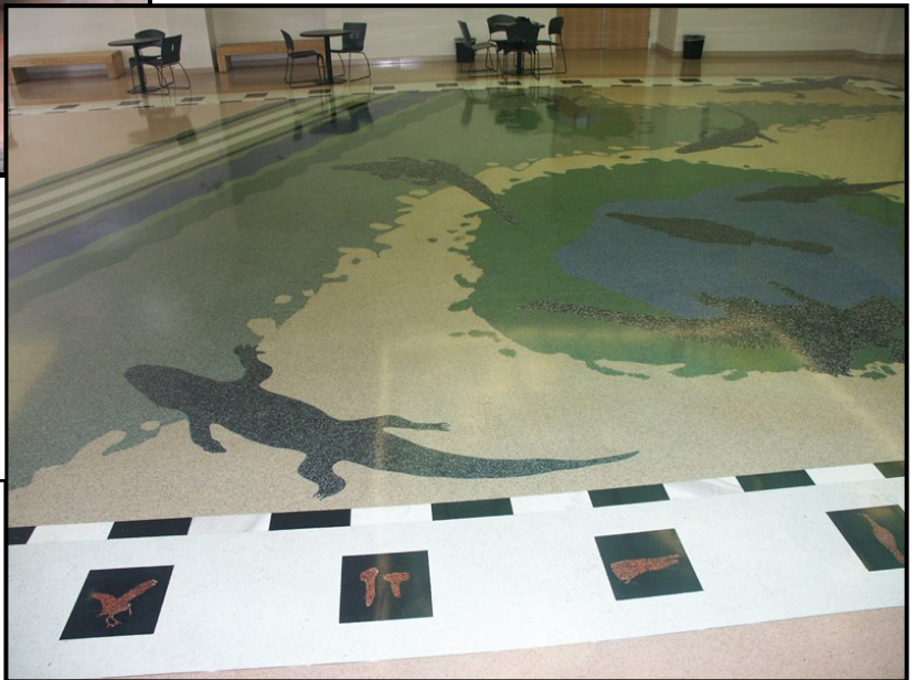
Installation: Pembroke Pines, FL Artist: Steward-Mellon Co.