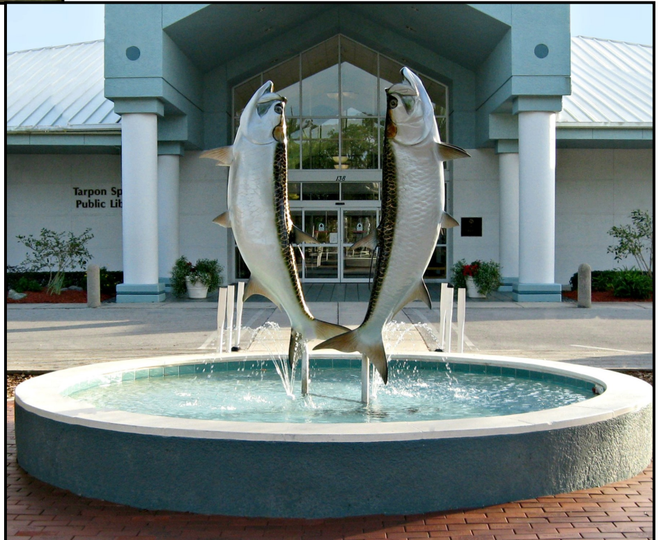
Installation: Tarpon Springs, FL Artist: Atlantic Taxidermy