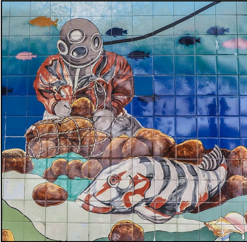
Installation: Tarpon Springs, FL Artist unknown