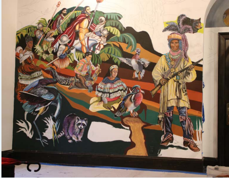
From the top: Indianos Mural (Cultural Center; in progress), Solar-powered illuminated art box, Dolphin bike rack